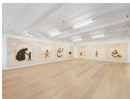
Spaces of Subjection: Zone of Nonbeing, 2022 pigment transfer and permanent marker on canvas 15 panels, each 84 x 84 x 2 inches Inventory #MEM22.007