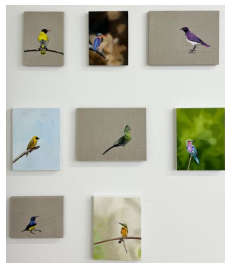
Spaces of Subjection: Divinations I, 2023 oil on canvas 12 panels: 5 panels at 9 x 12 x 1 inches 5 panels at 11 x 14 x 1 inches 2 panels at 12 x 16 x 1 inches Inventory #MEM23.003