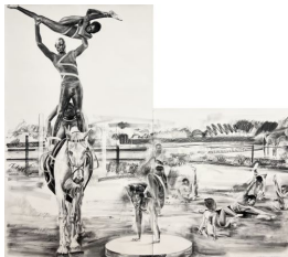
Spaces of Subjection: Black Drawing III, 2023 charcoal on paper diptych: 144 x 144 inches (overall) Inventory #MEM23.005