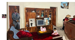
Spaces of Subjection: Imaging Imaginations V, 2023 oil on canvas Panel 1: 12 1/4 x 15 1/4 x 2 inches Panel 2: 96 x 168 x 2 inches Inventory #MEM23.001