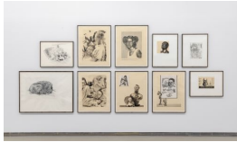
Spaces of Subjection: Imaging Imaginations IV, 2022 various medium such as lithography, etching, screenprints and chine collé 1/10, 10/10 (25 1/4 x 32 3/4 x 1 3/4 inches) framed 2/10, 3/10, 7/10, 8/10, 9/10 (41 1/4 x 32 3/4 x 1 3/4 inches) framed 4/10, 5/10 (32 3/4 x 25 1/4 x 1 3/4 inches) framed 6/10 (41 x 52 7/8 x 2 inches) framed Edition 6 of 10, with 3AP, 1PP, 1BAT Inventory #MEM22.014.6