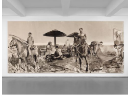
Spaces of Subjection: Black Painting III, 2022 oil on canvas 108 x 240 x 2 inches Inventory #MEM22.004