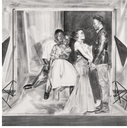
Spaces of Subjection: Black Drawing I, 2023 charcoal on canvas 84 x 84 x 2 inches Inventory #MEM23.002