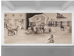
Spaces of Subjection: Black Painting I, 2022 oil on canvas 108 x 240 x 2 inches Inventory #MEM22.002