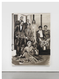
Spaces of Subjection: Black Painting V, 2022 oil on canvas 96 x 72 x 2 inches Inventory #MEM22.006