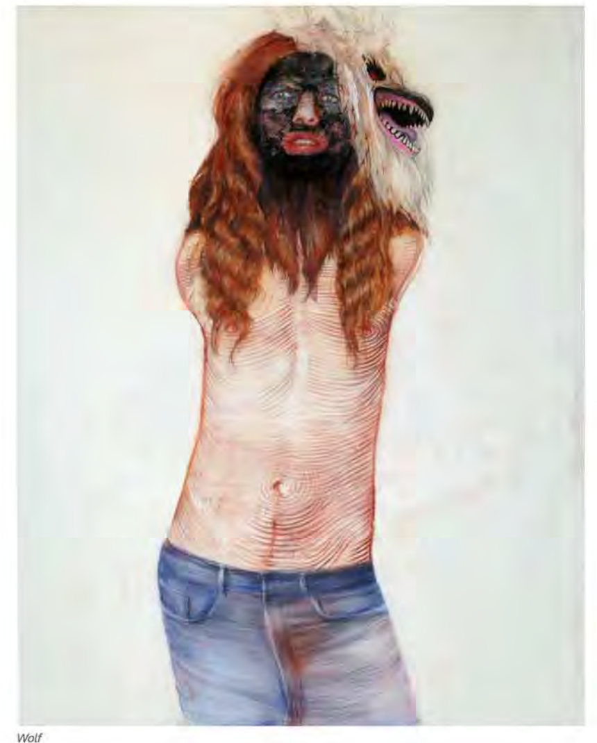
2011 Watercolor pencil on Mylar

GC: I have no grand narrative. I am no great revelator, although I enjoy and agree with your readings. I pursue the uncanny, but as a wary surrealist, who is suspicious of images that beg interpretation or that try to look weird or provocative. The multiple poses, limbs and faces—pentimenti—render indecision into full form. I read a review of a friend's show, which described her paintings as portraits of people who couldn't make up their minds about who they wanted to be. That description of multiplicity, confusion, playfulness of identities delighted me. That's what the internet was supposed to be about when it became a popular medium. People were talking about how you could reinvent yourself in chat rooms and be whoever you wanted to be. It was supposed to be a post-identity space. Instead, people have become even more entrenched in their identifications of who they'd like to be—and who they'd like to be with.