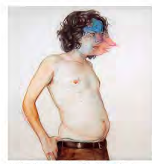
Geoffrey Chadsey, Portrait (Pink Beak), 2010, watercolor pencil on Mylar, 36 x 34".