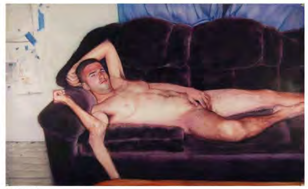
Black Couch 2010 Watercolor pencil on Mylar 36" x 60"

Someone asked me a few years ago if there was any empathy in these renderings. It's complicated. While looking at so many beautiful men online, I find myself collecting the photographs where the performances are wonky. There's some sort of excess that disrupts the aspiring hotness factor, like a bulging belly or an overenthusiastic hairdo. Empathy and delight enter in those moments. Popular gay iconography is all about desirability: beauty, youth, the fitness factor. I seek to capture a more disruptive figure, something you can't take your eyes off of, something disorienting, alien, horrific like a movie monster that rivets the gaze. Let's call it the aspirational abject.