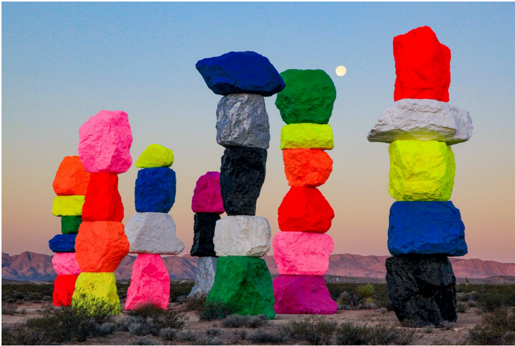
A photograph by Gianfranco Gorgoni of 'Seven Magic Mountains' by Ugo Rondinone, a 2016 land art work near Las Vegas.

artwork Ugo Rondinone