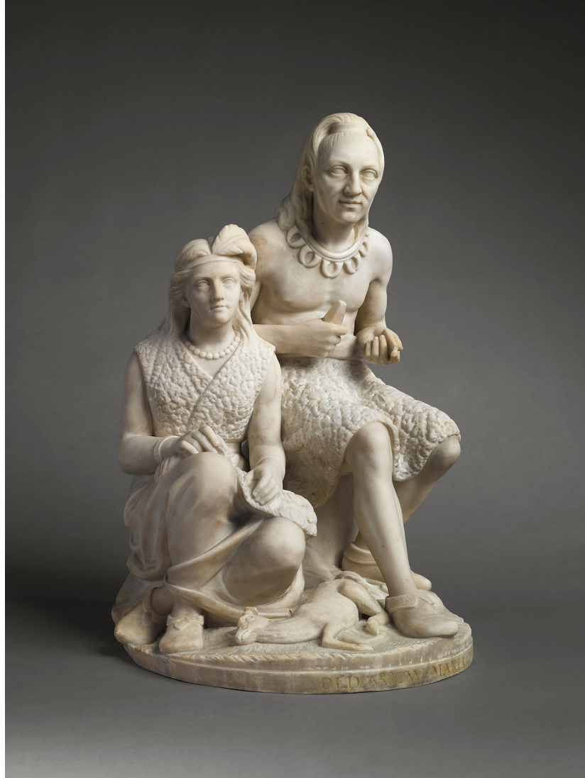
Edmonia Lewis, Mississauga and African American, "The Old Arrow Maker" (modeled 1866, carved c. 1872) Marble, 20 x 14 x 14 inches, (courtesy Crystal Bridges Museum of American Art Bentonville, Arkansas; photo: Sotheby's)

and lived in Rome, Italy. One of her most famous sculptures, "The Old Arrow Maker," is on view in the exhibition; it depicts Henry Wadsworth Longfellow's poem, "The Song of Hiawatha." Widely known for her sculpture "Forever Free," which represents two freed slaves, Lewis was known for creating narratives of Black and Indigenous people as a dogged means of inclusion. However, in spite of her efforts and mastery of Western sculpture, Lewis is rarely included in contemporary discussions of neoclassical art, even when these discussions are centered on women artists.