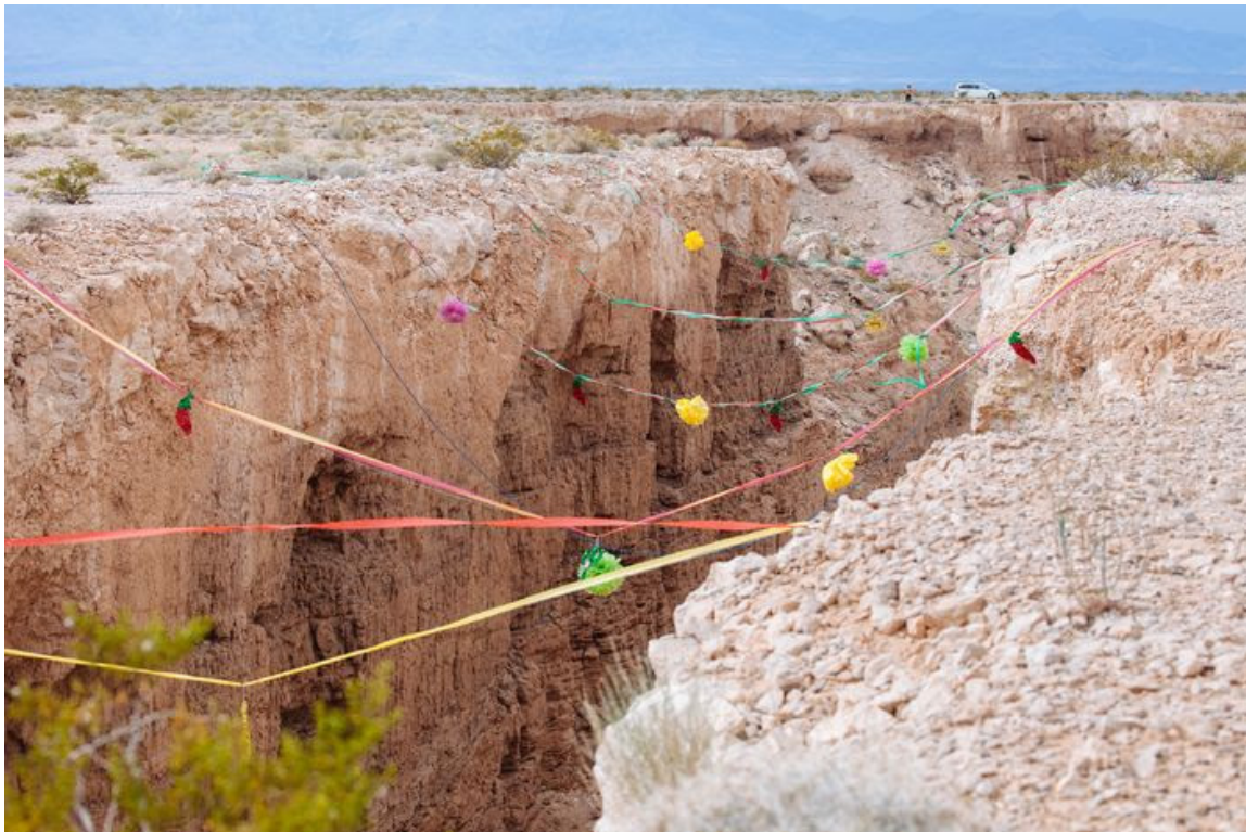
Justin Favela's 'Family Fiesta: Double Negative' (2015) staged a pop-up party at the site of a 1969 land art work by Michael Heizer.

A model of "Seven Magic Mountains" is among the first works on view in "Land Art: Expanding the Atlas." Grouped under broad themes like Ground, Water, Space and Ruin, some 80 works by close to 50 artists trace an alternate history of the field, proposing different definitions of what land art might be.