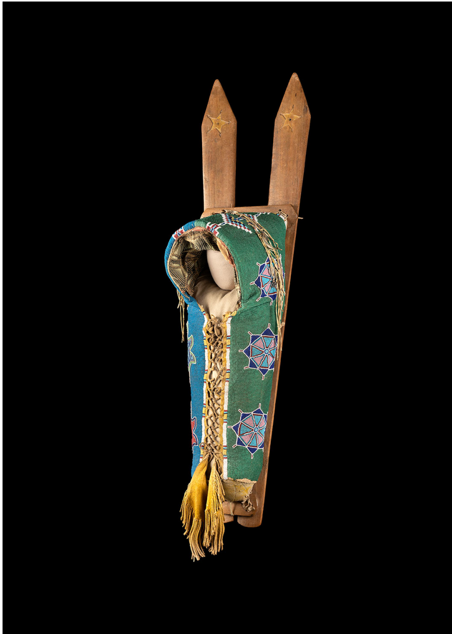
Kiowa artist, "Cradleboard" (1890) Wood, leather, venetian glass beadwork 43 ½ x 11 ½ x 10 ½ inches