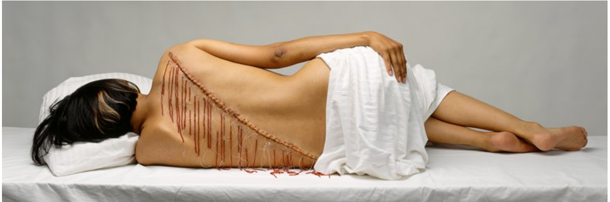
Rebecca Belmore, Fringe, 2007, Transparency in light box, 96 1/4 x 32 3/4 x 6 1/2 inches