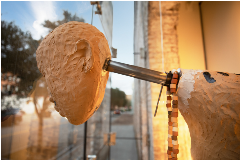
View of Rose B. Simpson, Countdown , 2021 at SCAD Museum of Art. Courtesy of the artist and Jessica Silverman, San Francisco. Photo courtesy of SCAD.

Defying gravity, the four 8-foot clay bodies of Rose B. Simpson's Countdown , her new body of works commissioned by the SCAD Museum of Art, pack a powerful presence. The figures stick their necks out, fully leaning with foreheads against the glass. It's an act of tremendous faith, an assumption that both the glass will hold, and we, the viewer, will catch them if all falls apart. The figures themselves are thin, androgynous, their bodies built from pockmarked clay surfaces. They are impressive, adorned with Native American glyphs and long hanging prayer beads. Their faces are stripped down, eroded to their essential humble cores with stoic expressions. Laid bare, the four figures feel as though they directly gaze at us in compassionate confrontation, a sincere attempt at reasoning. The viewer is left to answer their provocation with a broad tapestry of potential meanings: deeper understandings of nature and death, power and politics, capitalism and strength, art, and beauty. Standing under these sculptures is an emotional journey of mind and body.