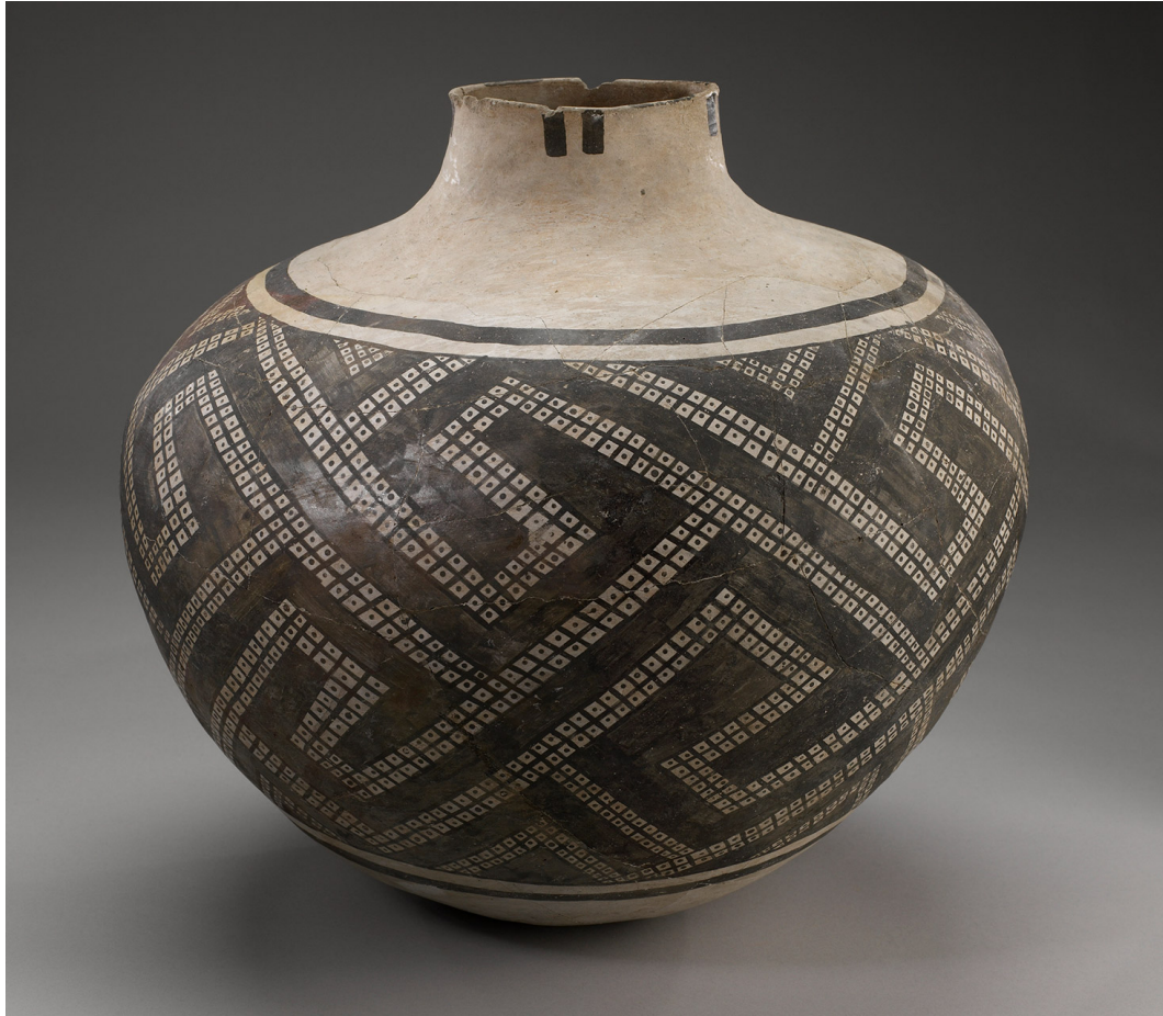
Ancient Pueblo artist, "Pot (Olla)" (c. 1000–1300) Clay, pigments

practice. Both curators were dedicated to presenting the show through an immersive collaboration process that centered Indigenous values, rather than the translation of these values into palatable white supremacist standards.