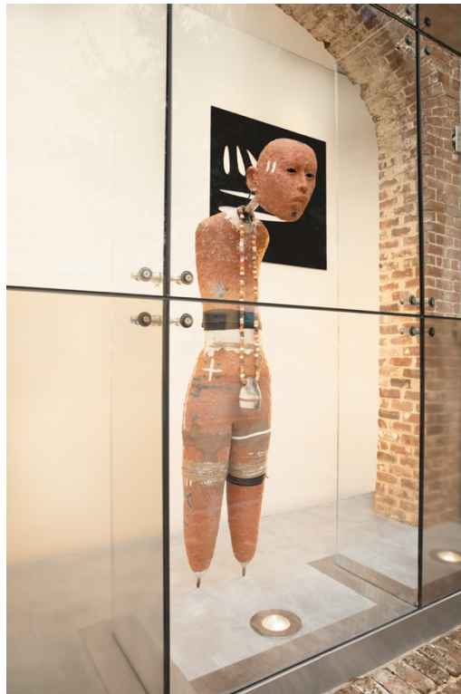
View of Rose B. Simpson, Countdown , 2021 at SCAD Museum of Art. Courtesy of the artist and Jessica Silverman, San Francisco. Photo courtesy of SCAD.

The exhibition is so captivating, but I can never fully take my mind off the SCAD Museum of Art as a building. The museum is situated in a renovated antebellum railroad complex. The distinctive Savannah Gray Bricks that make up the railway structure and the surrounding freight warehouses date back to 1853. When Henry McAlpin, the owner of the Hermitage Plantation, realized his land was situated on a rare-grey colored clay that was not suitable for crops, he redirected the labor of enslaved people from farming to hand-forming bricks—the resulting materials made the foundation for this art museum in a historically preserved building. The museum building itself conjures irreconcilable issues of monumentality, of memory, life, the hereafter.