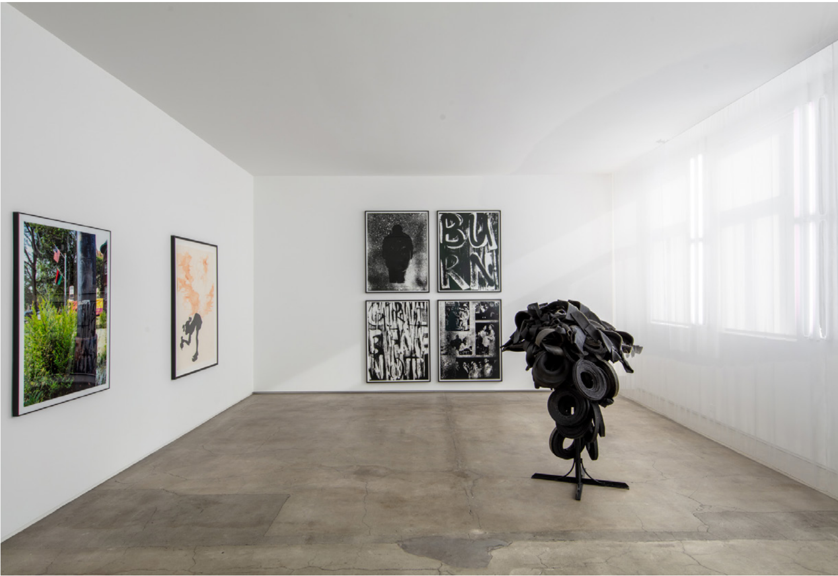
Installation view, This Tender, Fragile Thing , 2022 The School | Jack Shainman Gallery, Kinderhook, NY