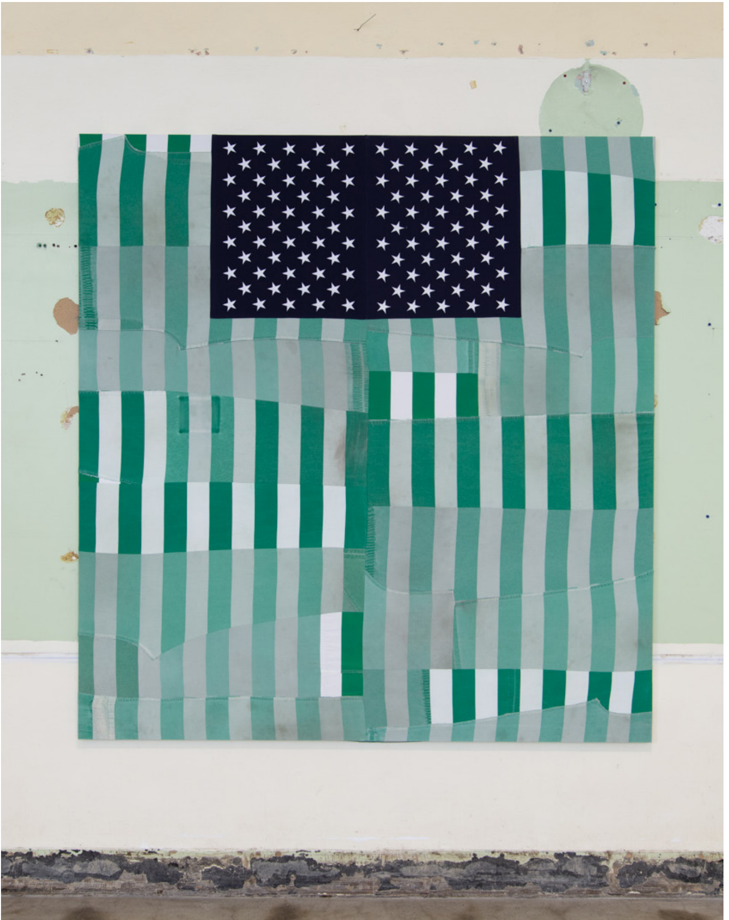
Hank Willis Thomas| Star Spangled Banner | 2020

Quilt made out of decommissioned prison uniforms | 78 x 74 1/2 x 1 1/2 inches | #HWT20.055