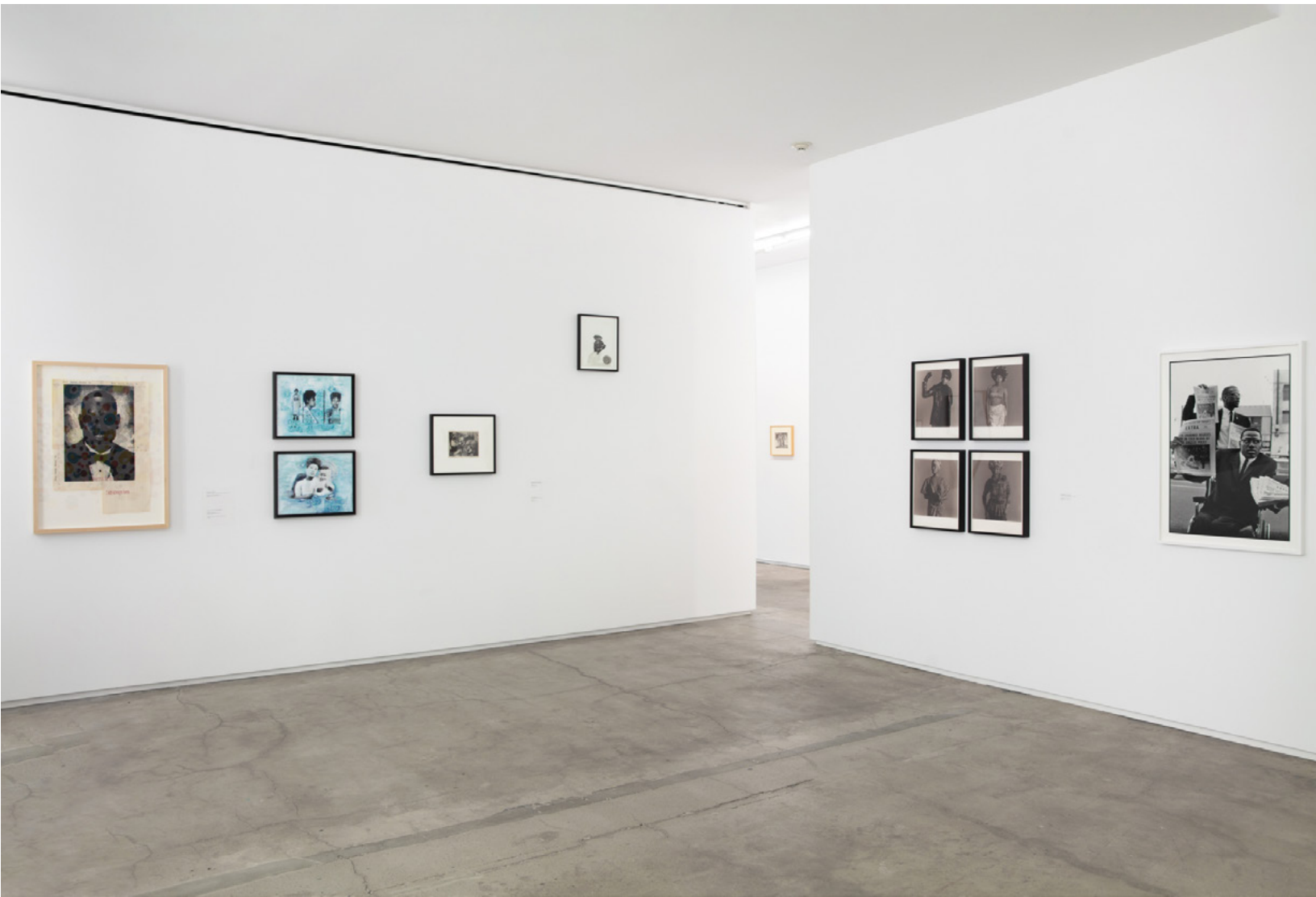
Installation view, This Tender, Fragile Thing , 2022 The School | Jack Shainman Gallery, Kinderhook, NY