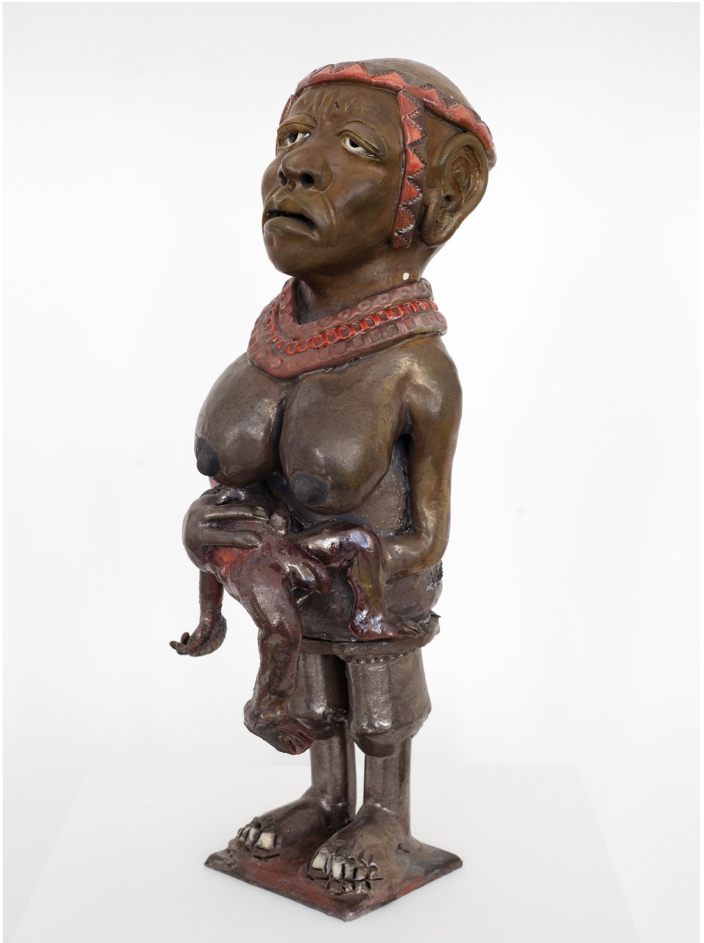
Akinsanya Kambon | Nehanda | 2013 Raku-fired clay | 19 5/8 x 7 x 5 1/2 inches | #AKK13.003