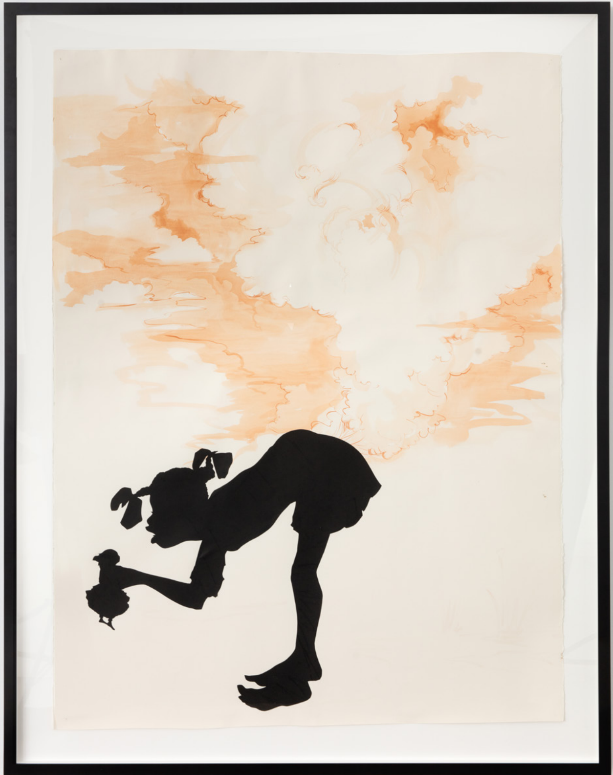
Kara Walker | Untitled | 1996 Cut paper collage and watercolor on paper | 55 1/2 inches x 42 inches | #KW96.001