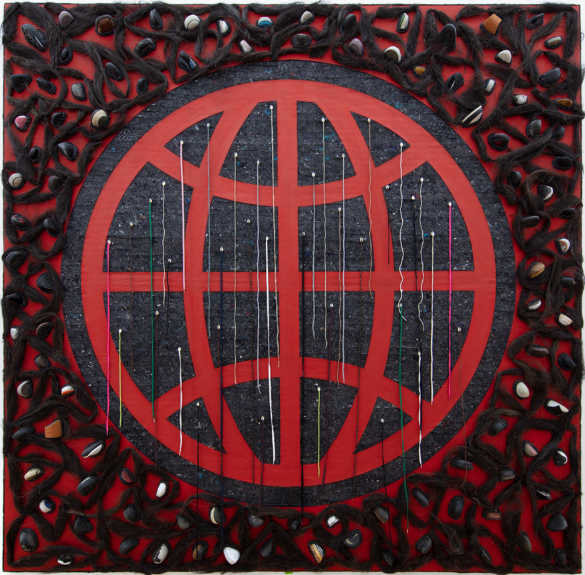
Nari Ward | Third World Bank | 2010

Stencil ink, vinyl Chase construction banner, felt weather seal, metallic fabric | 120 x 120 x 1 1/2 inches | #NW10.001