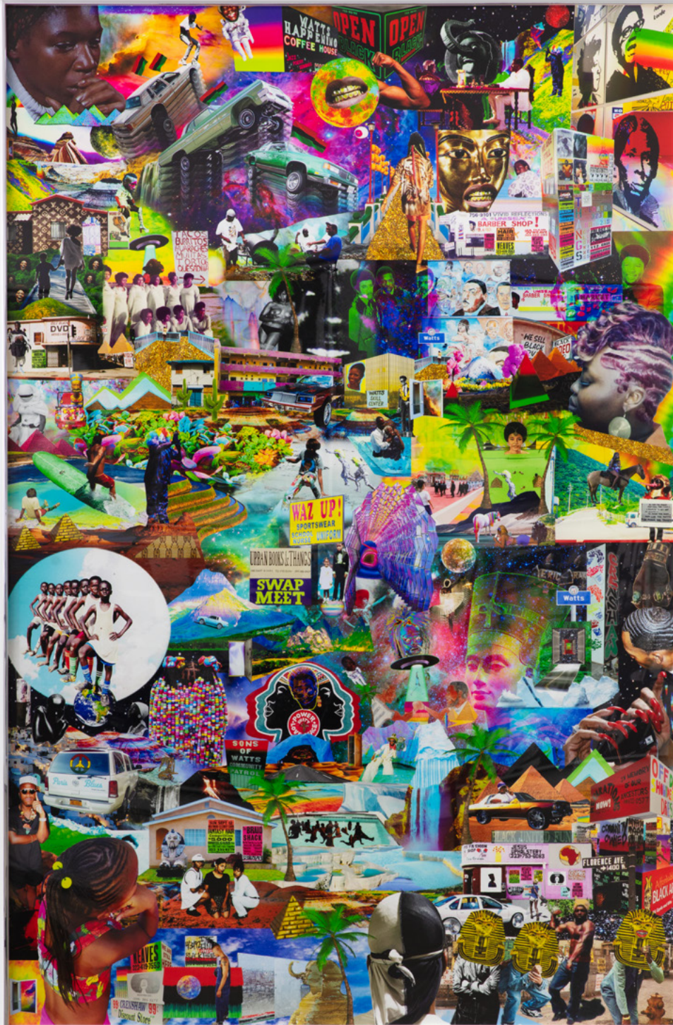
Lauren Halsey | Watts Happening | 2021

Inkjet print on paper | 96 x 62 1/2 inches (print) | 96 1/4 x 62 3/4 x 2 inches (framed) | Edition of 6, with 2AP | #LHY21.005