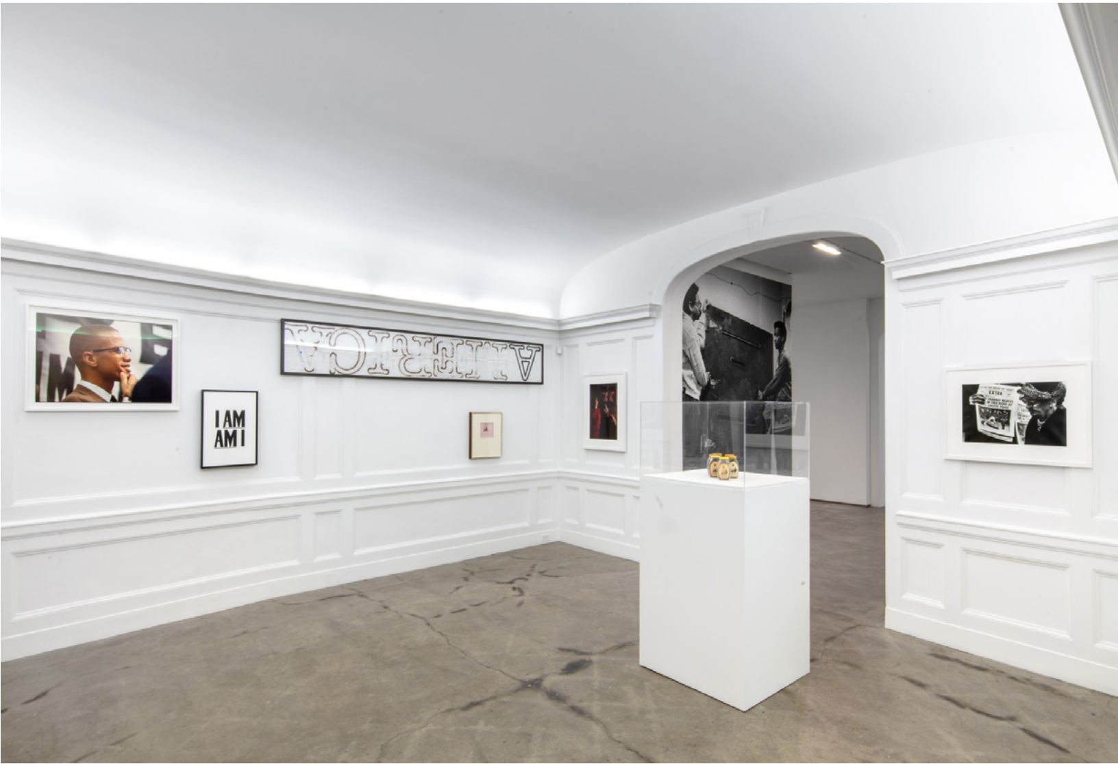
Installation view, This Tender, Fragile Thing , 2022 The School | Jack Shainman Gallery, Kinderhook, NY