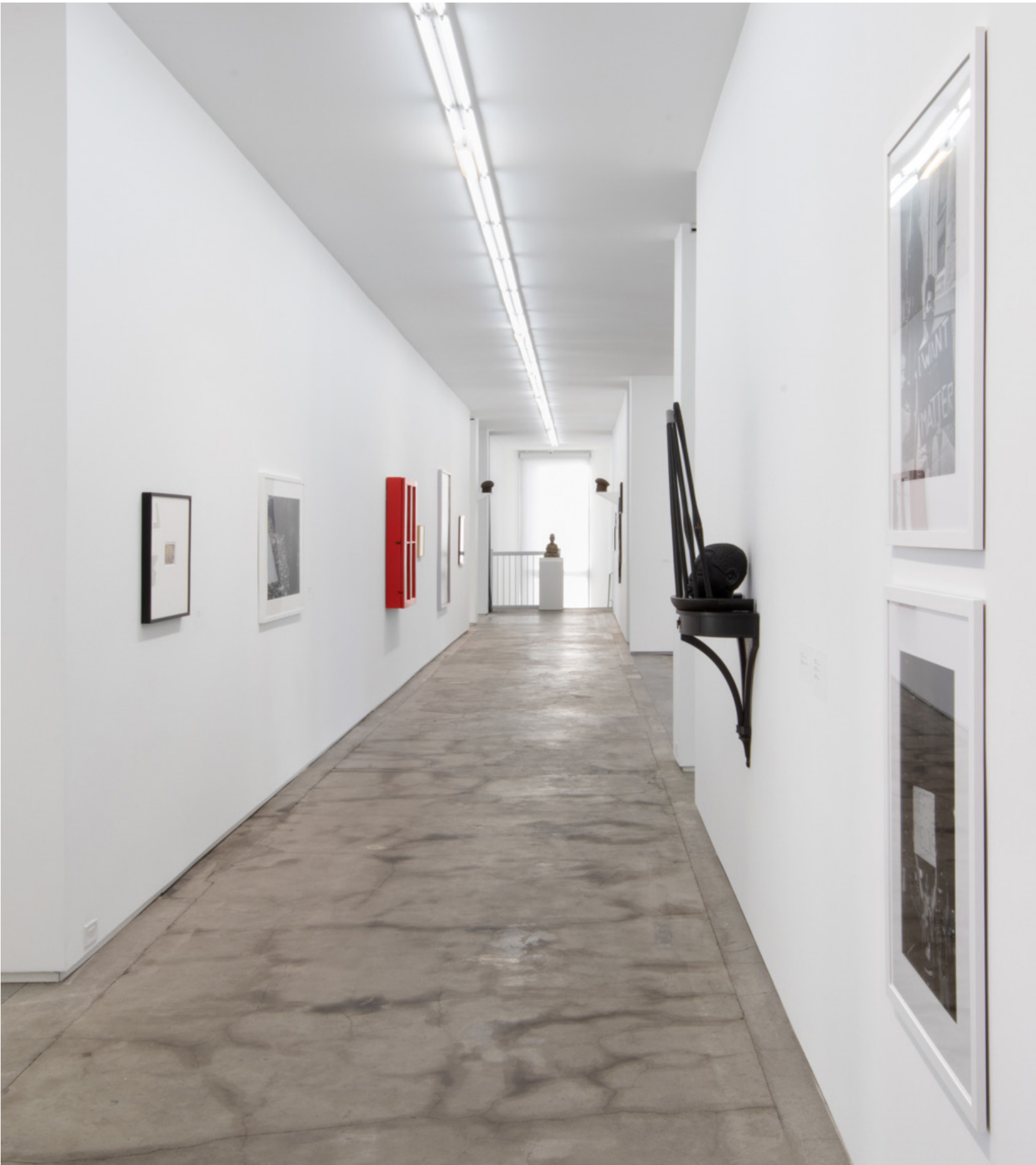
Installation view, This Tender, Fragile Thing , 2022 The School | Jack Shainman Gallery, Kinderhook, NY