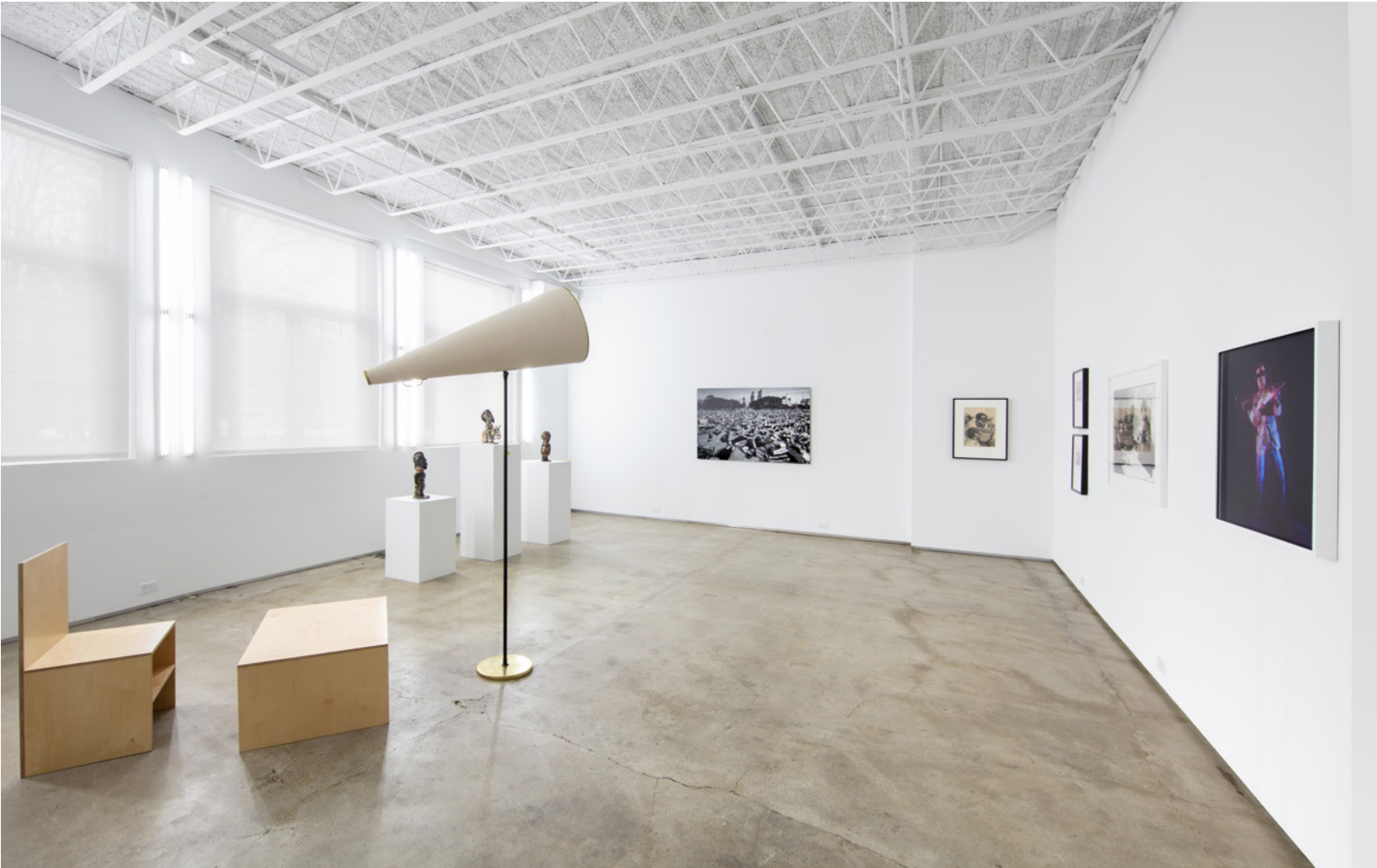
Installation view, This Tender, Fragile Thing , 2022 The School | Jack Shainman Gallery, Kinderhook, NY