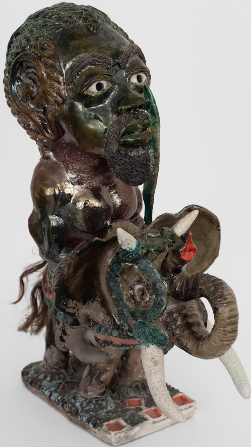
Akinsanya Kambon | Equestrian Hannibal of Carthage | 2012 Raku-fired clay | 14 1/2 x 10 inches | #AKK12.002