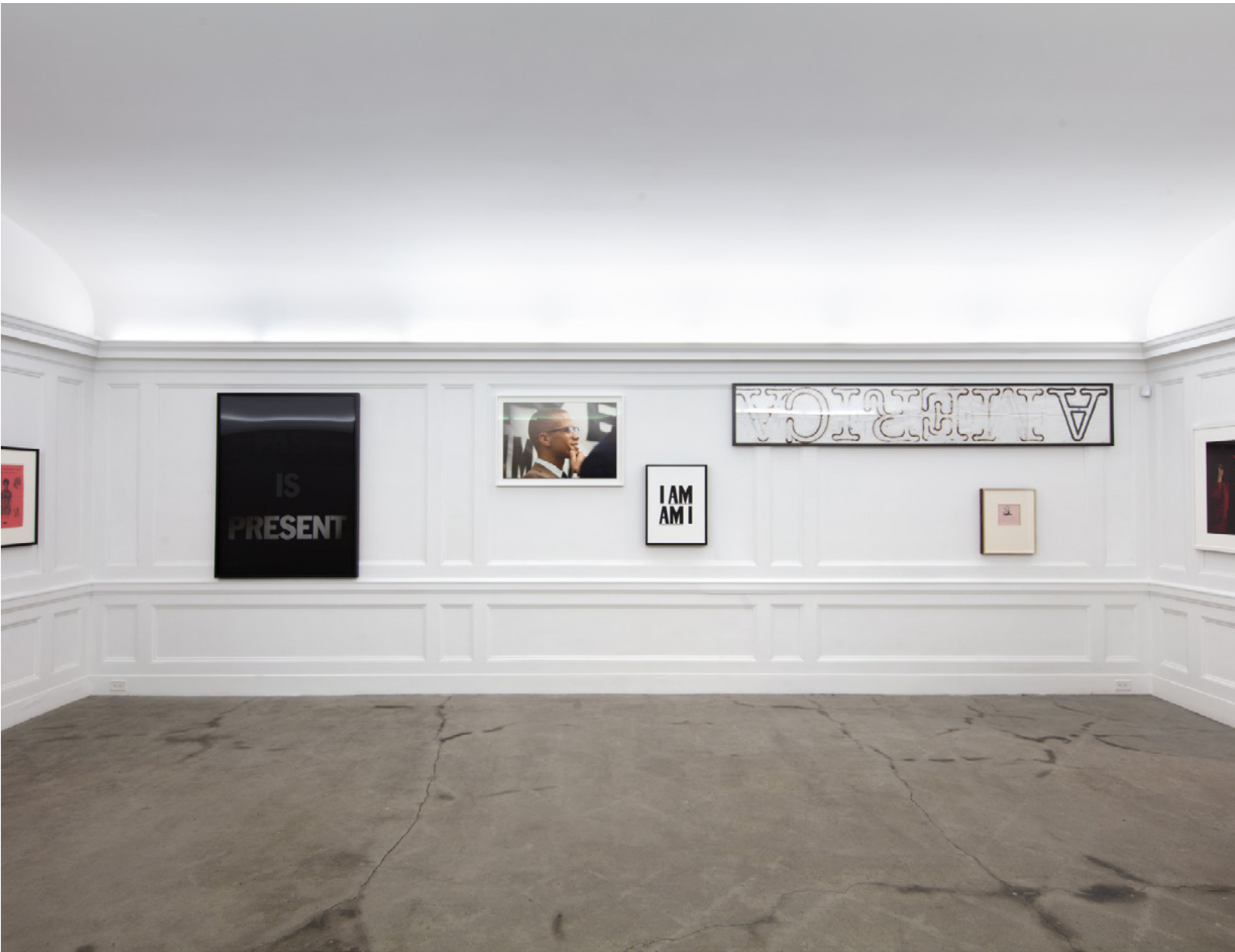
Installation view, This Tender, Fragile Thing , 2022 The School | Jack Shainman Gallery, Kinderhook, NY