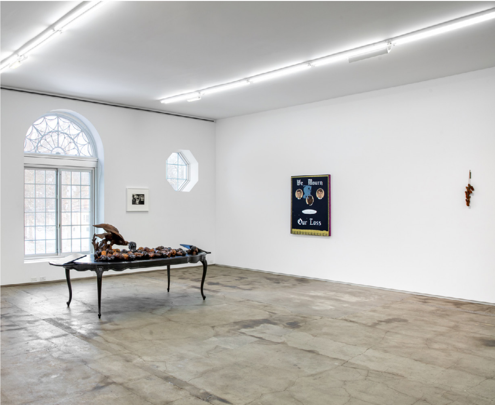
Installation view, This Tender, Fragile Thing , 2022 The School | Jack Shainman Gallery, Kinderhook, NY