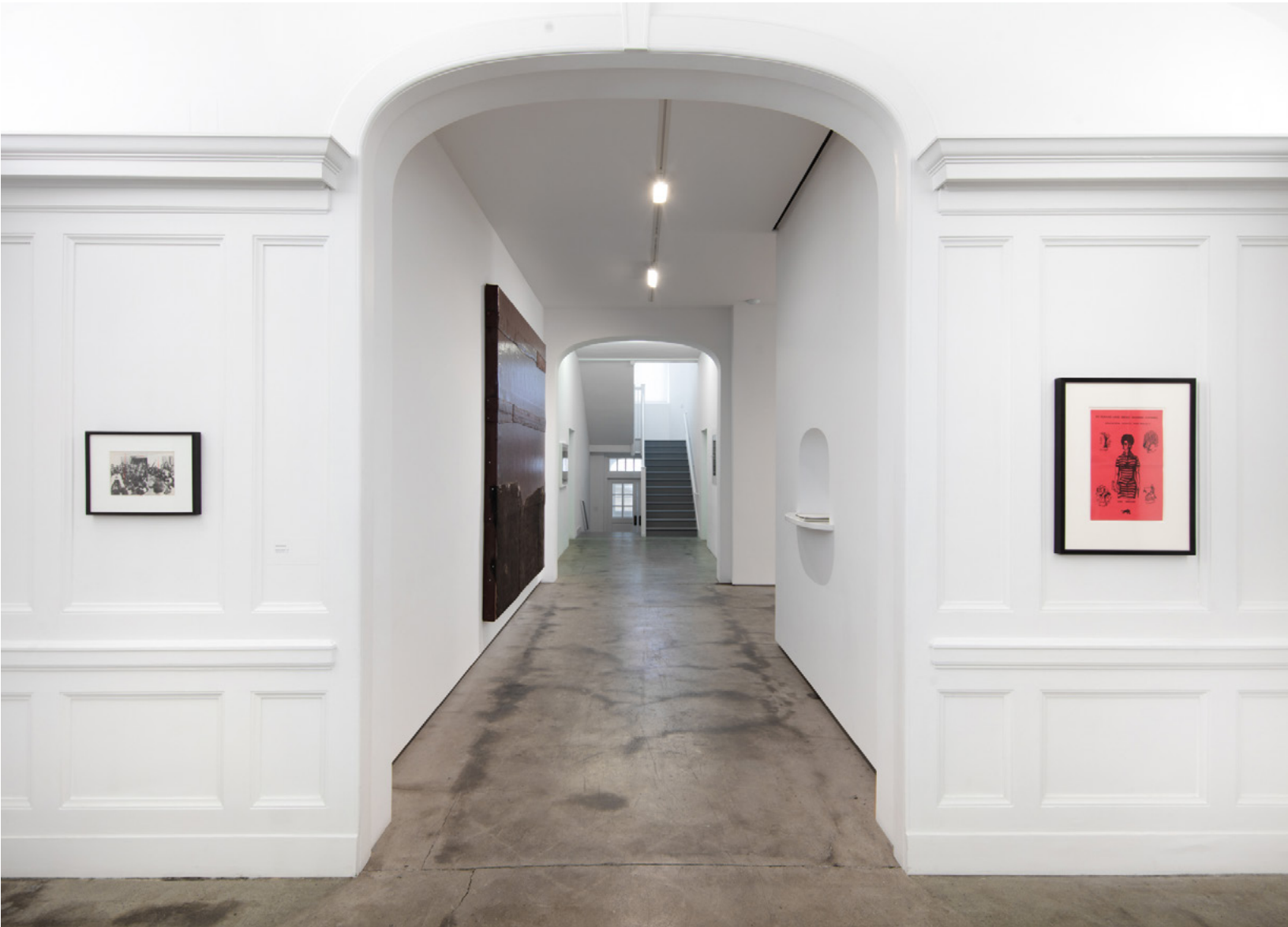
Installation view, This Tender, Fragile Thing , 2022 The School | Jack Shainman Gallery, Kinderhook, NY