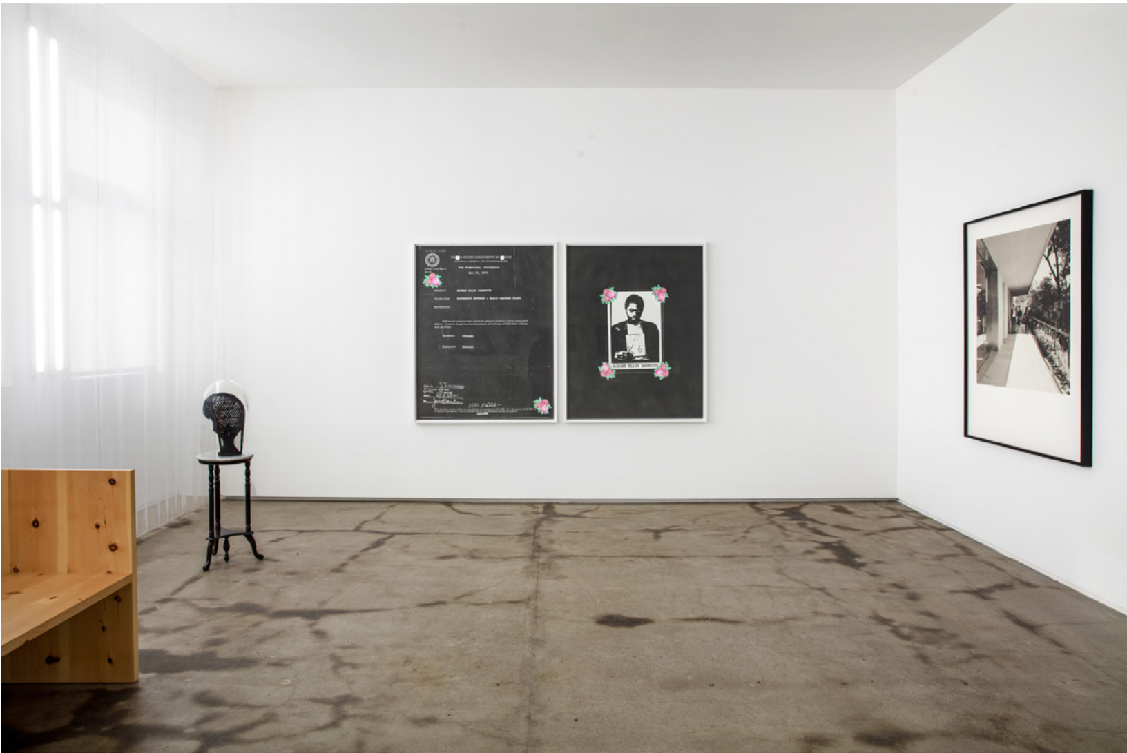
Installation view featuring works by Radcliffe Bailey, Sadie Barnette, and Carrie Mae Weems, This Tender, Fragile Thing , 2022 The School | Jack Shainman Gallery, Kinderhook, NY