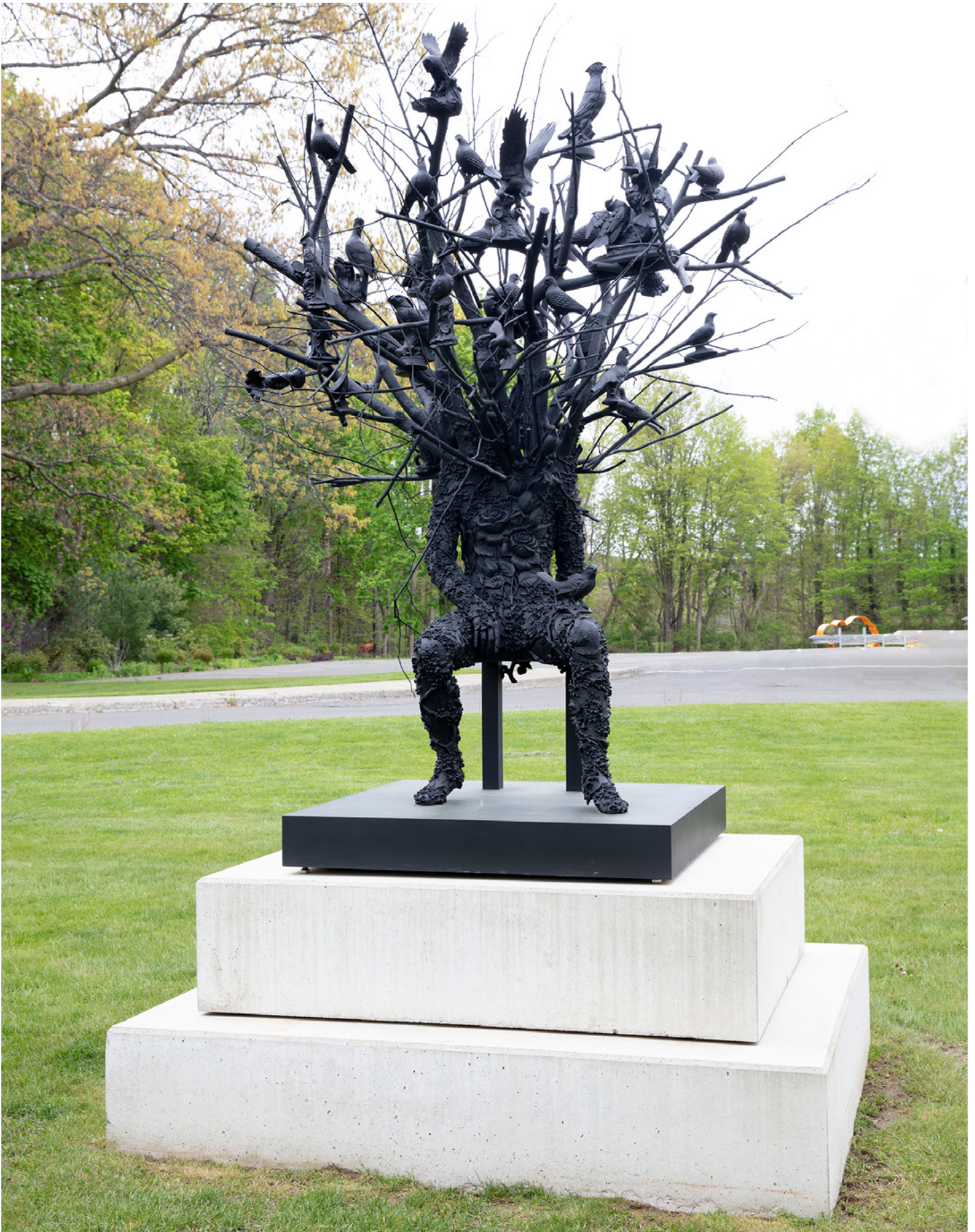
Nick Cave | A-mal-gam | 2021 | Bronze | 122 x 94 x 85 inches | Edition of 8, with 2APs