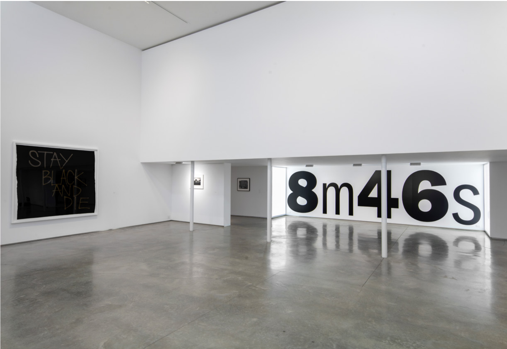
Installation view featuring Rashid Johnson, Gordon Parks, and Nick Cave, This Tender, Fragile Thing , 2022 The School | Jack Shainman Gallery, Kinderhook, NY