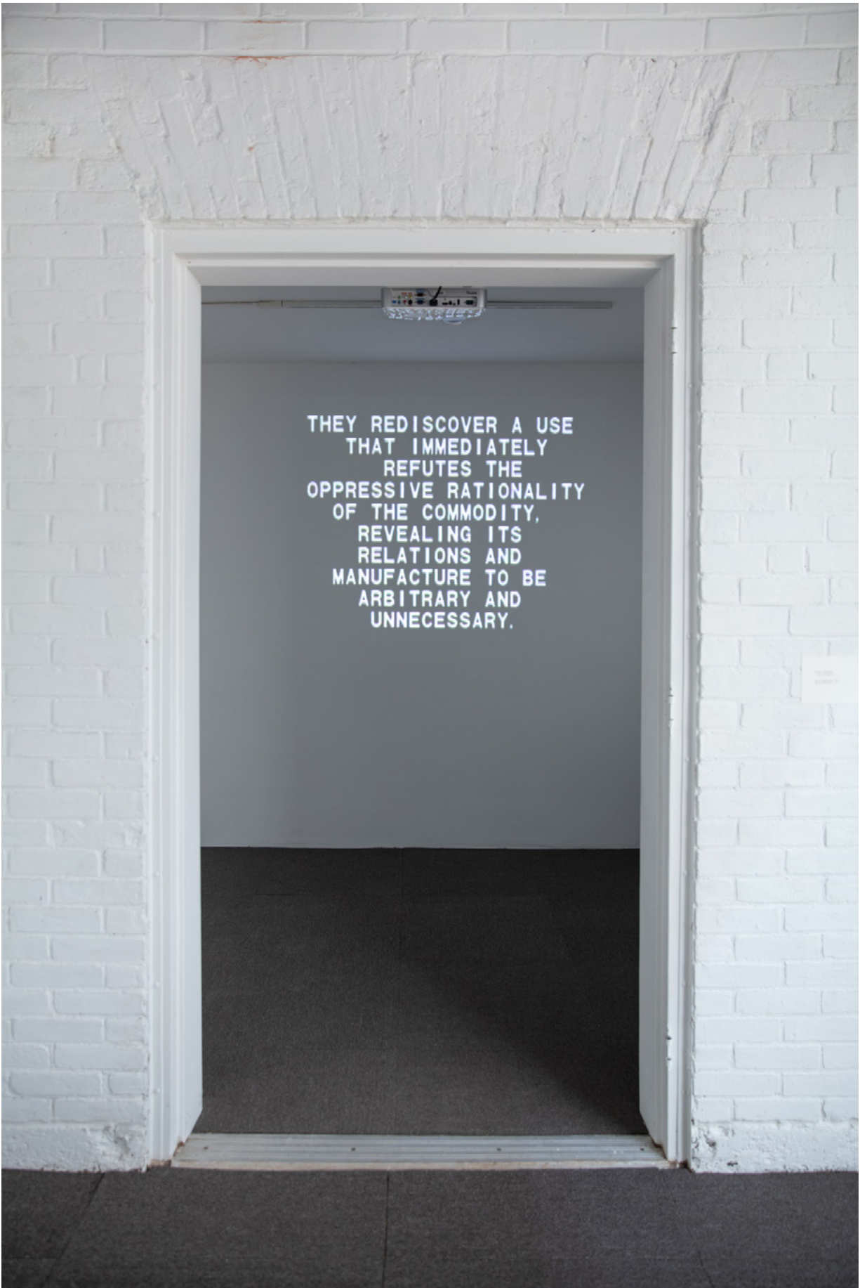
Installation view featuring Tony Cokes, This Tender, Fragile Thing , 2022 The School | Jack Shainman Gallery, Kinderhook, NY