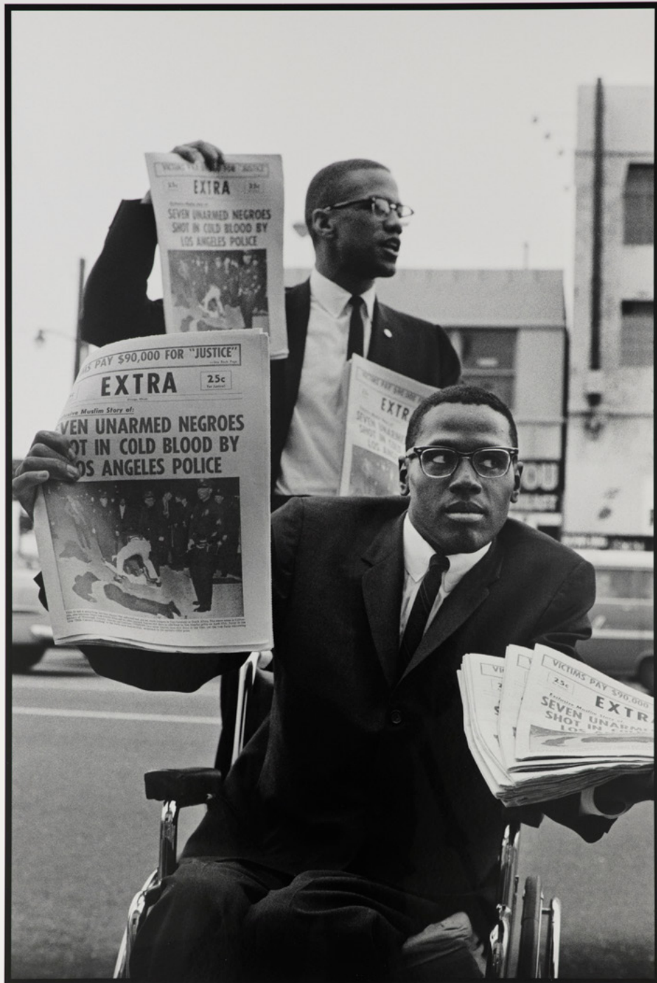
Gordon Parks | Untitled, Los Angeles, California | 1963 Gelatin silver print | 40 3/4 x 28 3/4 x 1 3/4 inches (framed) | Edition of 7, with 2 APs | #GP63.030