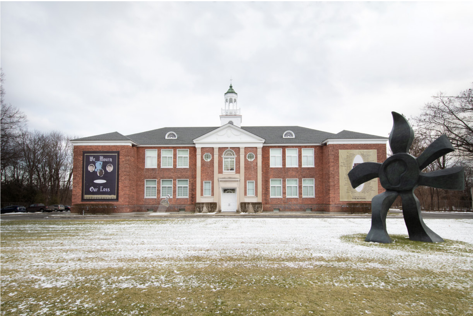
Installation view, This Tender, Fragile Thing , 2022 The School | Jack Shainman Gallery, Kinderhook, NY