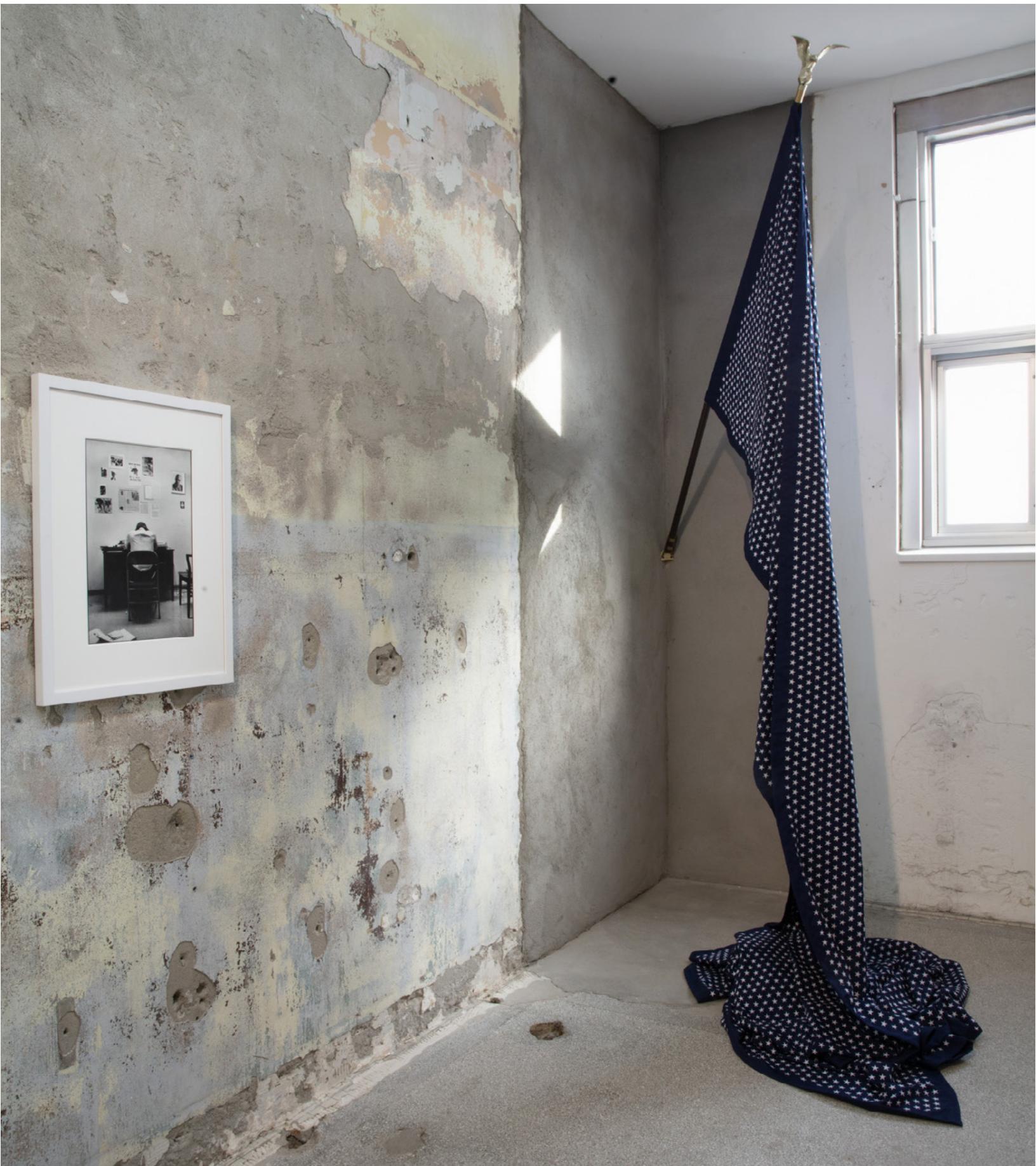
Installation view featuring Gordon Parks and Hank Willis Thomas, This Tender, Fragile Thing , 2022 The School | Jack Shainman Gallery, Kinderhook, NY