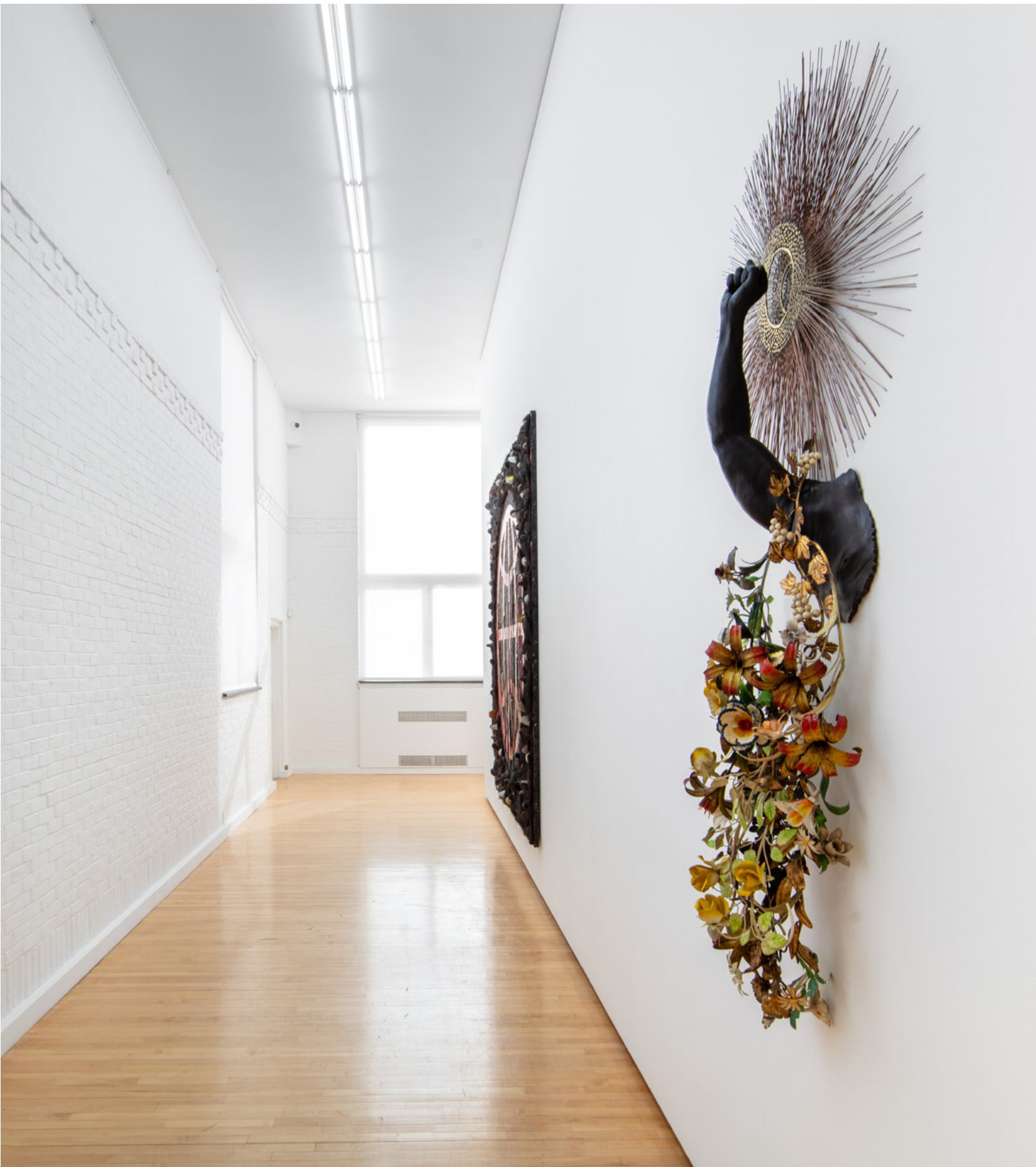
Installation view featuring Nari Ward and Nick Cave, This Tender, Fragile Thing , 2022 The School | Jack Shainman Gallery, Kinderhook, NY