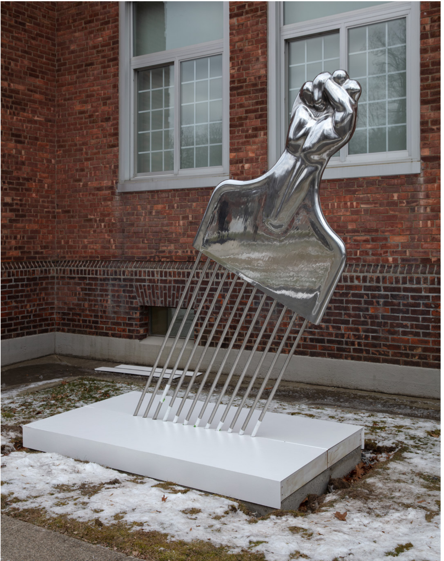
Hank Willis Thomas | All Power to All People (Reflection) | 2021 Aluminum and stainless steel | 98 x 43 1/2 x 2 1/2 inches | Edition of 3, with 1AP | #HWT21.029