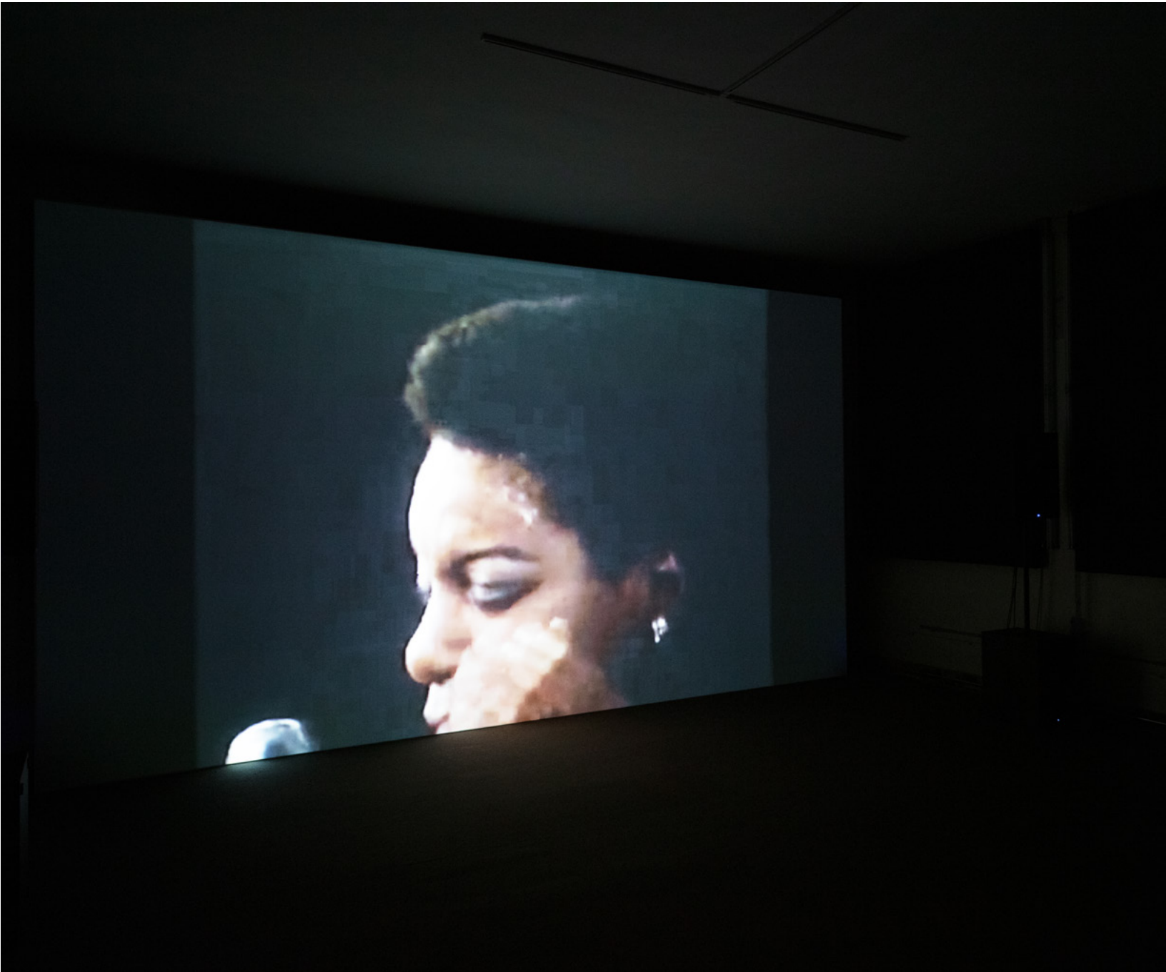
Installation view featuring Arthur Jafa, This Tender, Fragile Thing , 2022 The School | Jack Shainman Gallery, Kinderhook, NY