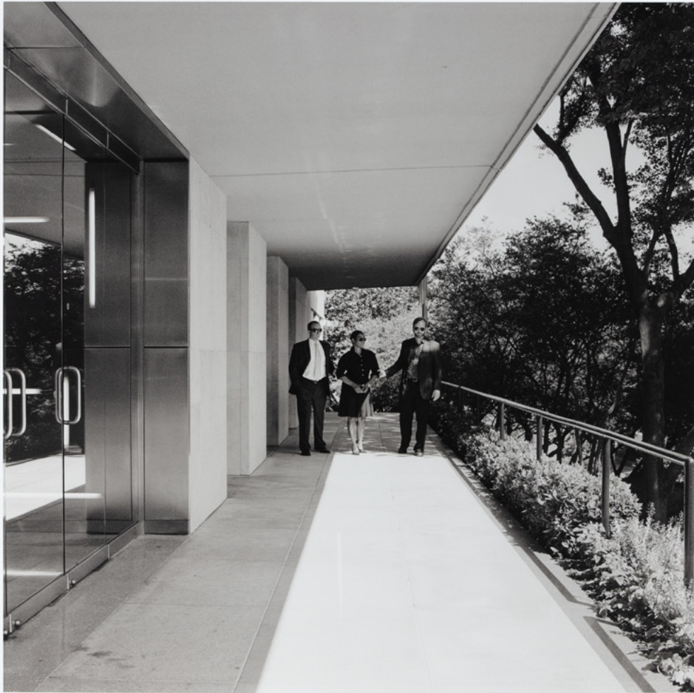
Carrie Mae Weems | The Capture of Angela | 2008

Archival pigment print | 60 13/16 x 50 7/8 x 2 1/4 inches (Framed) | Edition of 5, with 2 APs | #CMW08.057