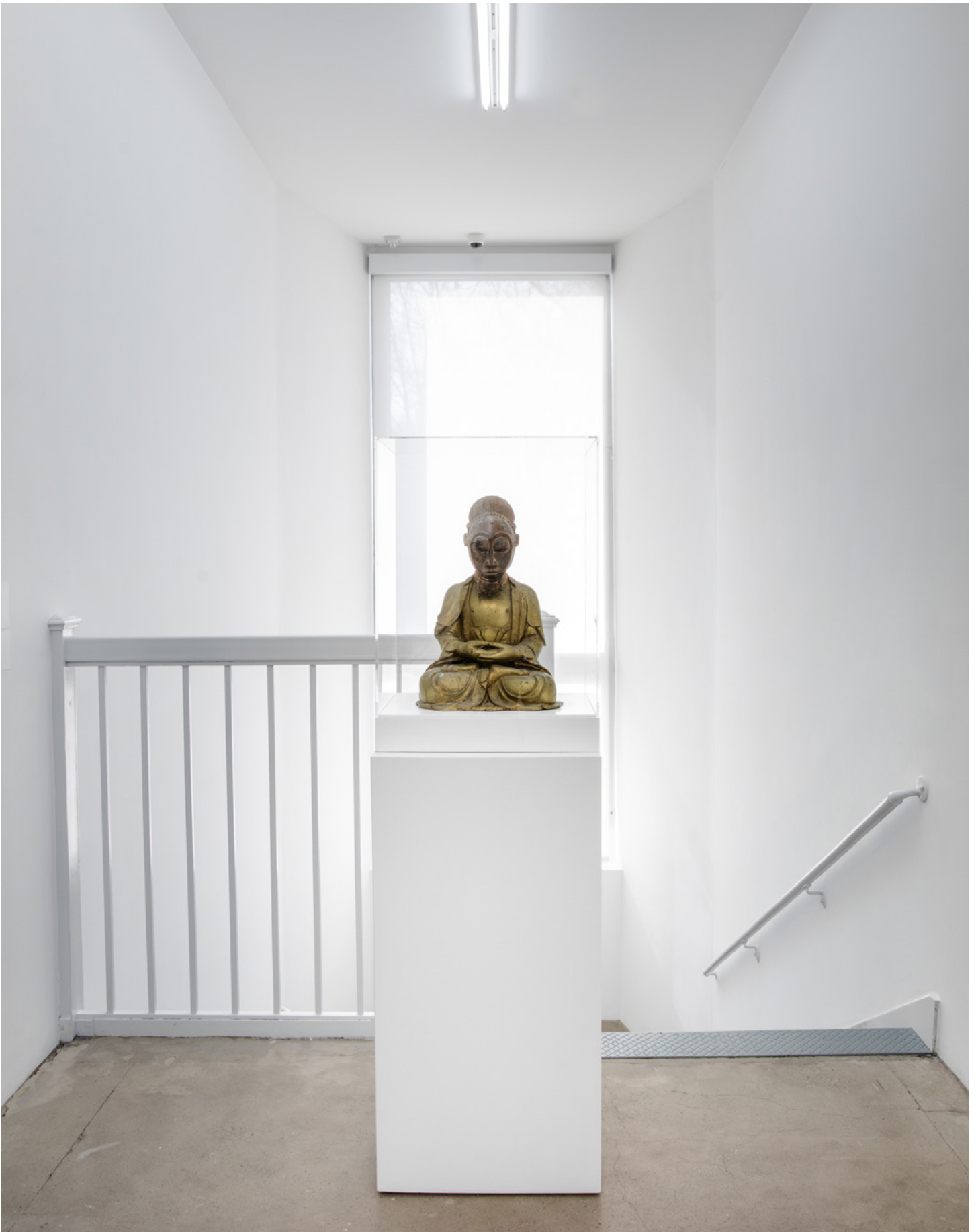
David Hammons | Untitled | n.d. African mask, Buddha statue | 20 1/2 x 15 x 11 inches | #DHA21.004