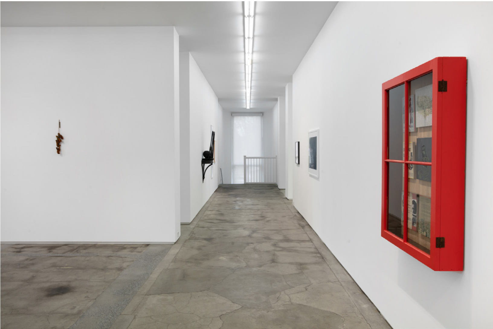
Installation view, This Tender, Fragile Thing , 2022 The School | Jack Shainman Gallery, Kinderhook, NY