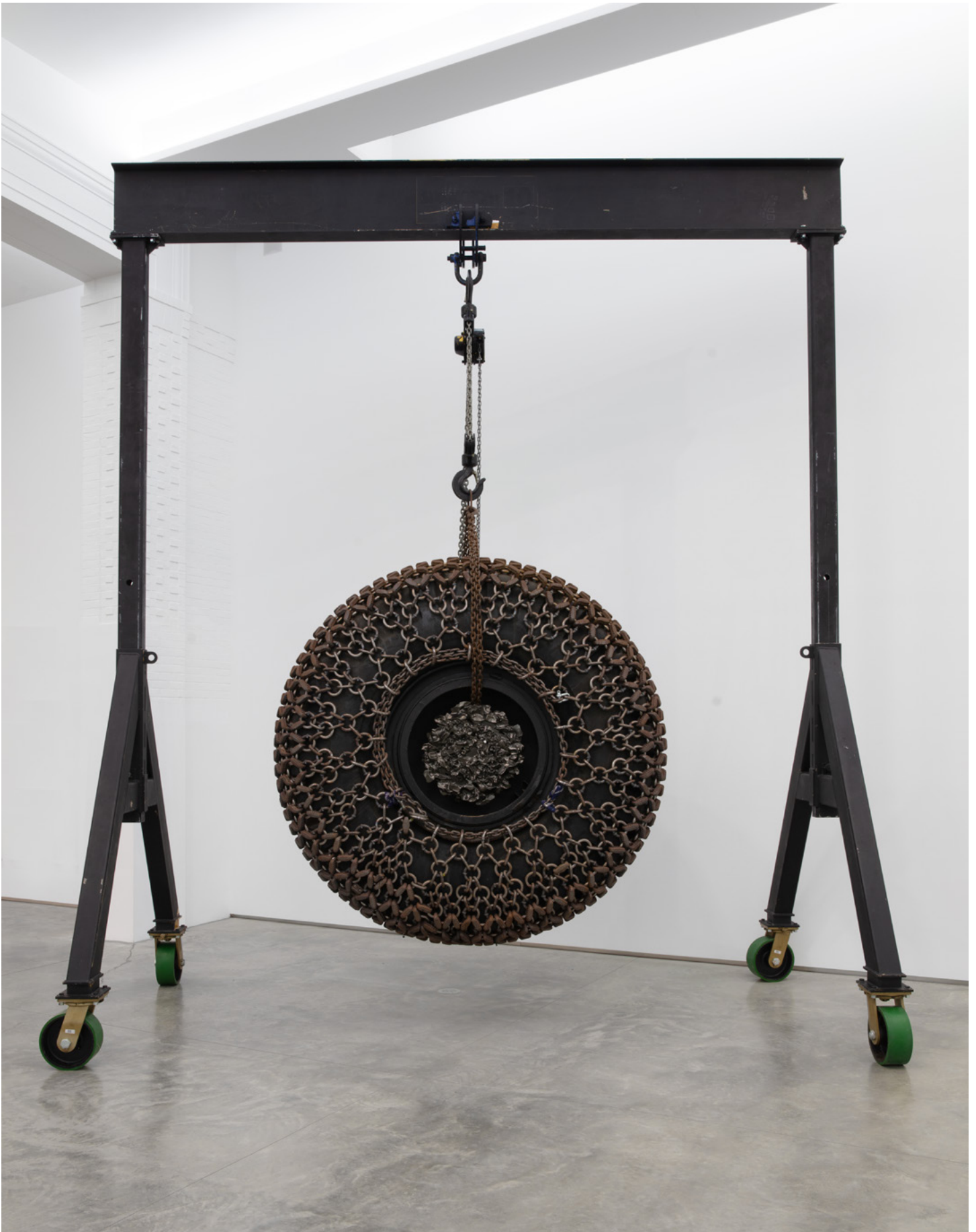
Arthur Jafa | Big Wheel I | 2018 Chains, rim, hubcap, and tire | 212 x 186 x 87 inches | #ARJ18.001