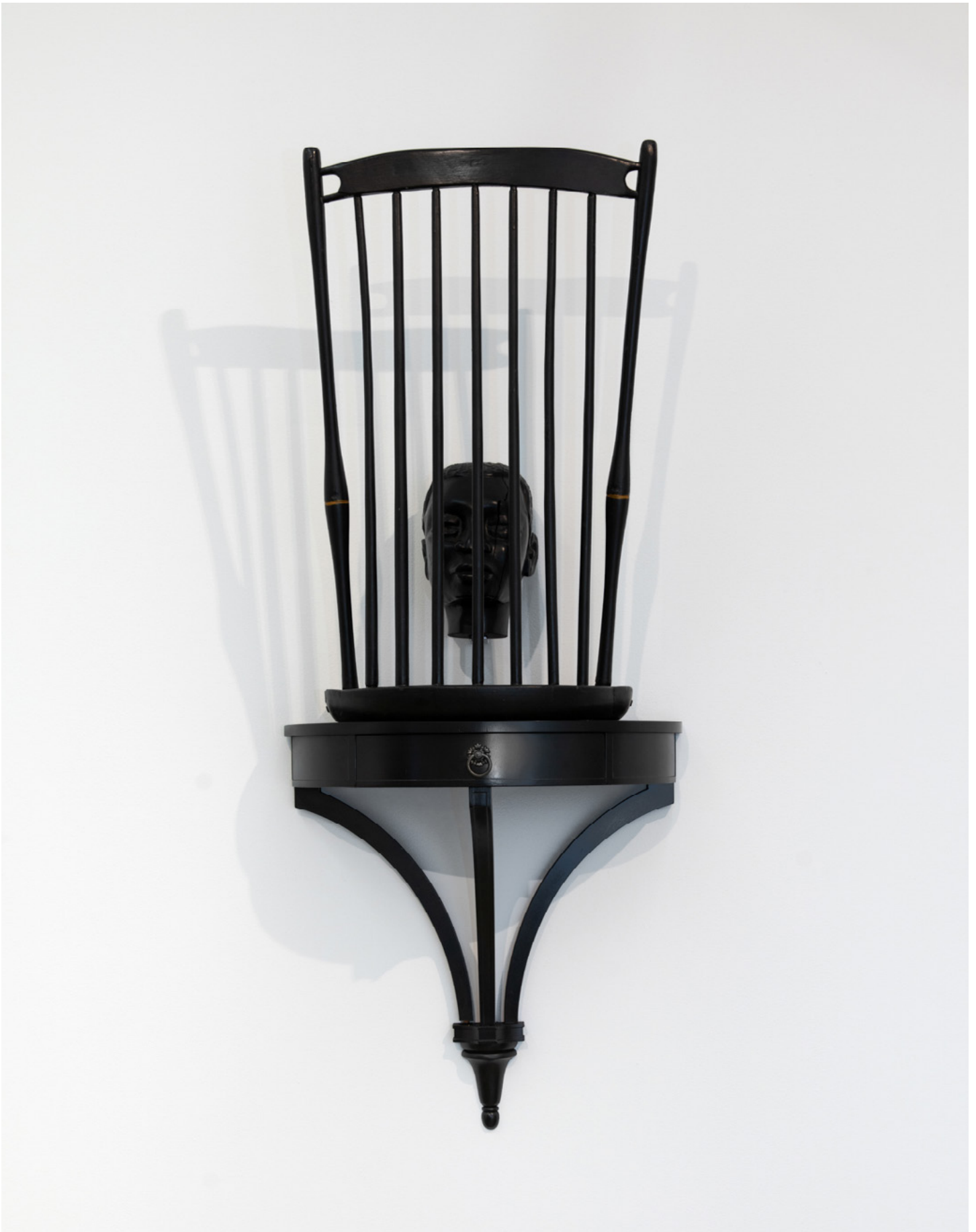
Nick Cave | Untitled | 2018

Mixed media including carved head, back of a chair, modified table top | 56 3/4 x 24 1/4 x 12 7/8 inches | #NC18.059