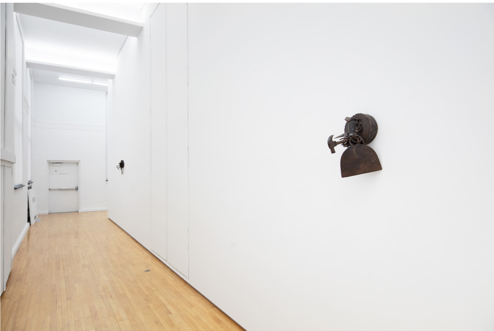
Installation view featuring Melvin Edwards, This Tender, Fragile Thing , 2022 The School | Jack Shainman Gallery, Kinderhook, NY