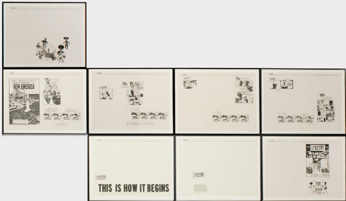
Kerry James Marshall | Dailies from Rythm Mastr | 2010

Suite of 8 silkscreen prints on paper | 22 x 29 7/8 inches (paper) 23 7/8 x 31 1/2 inches (each, framed) | Edition of 5 | #KM10.008.5