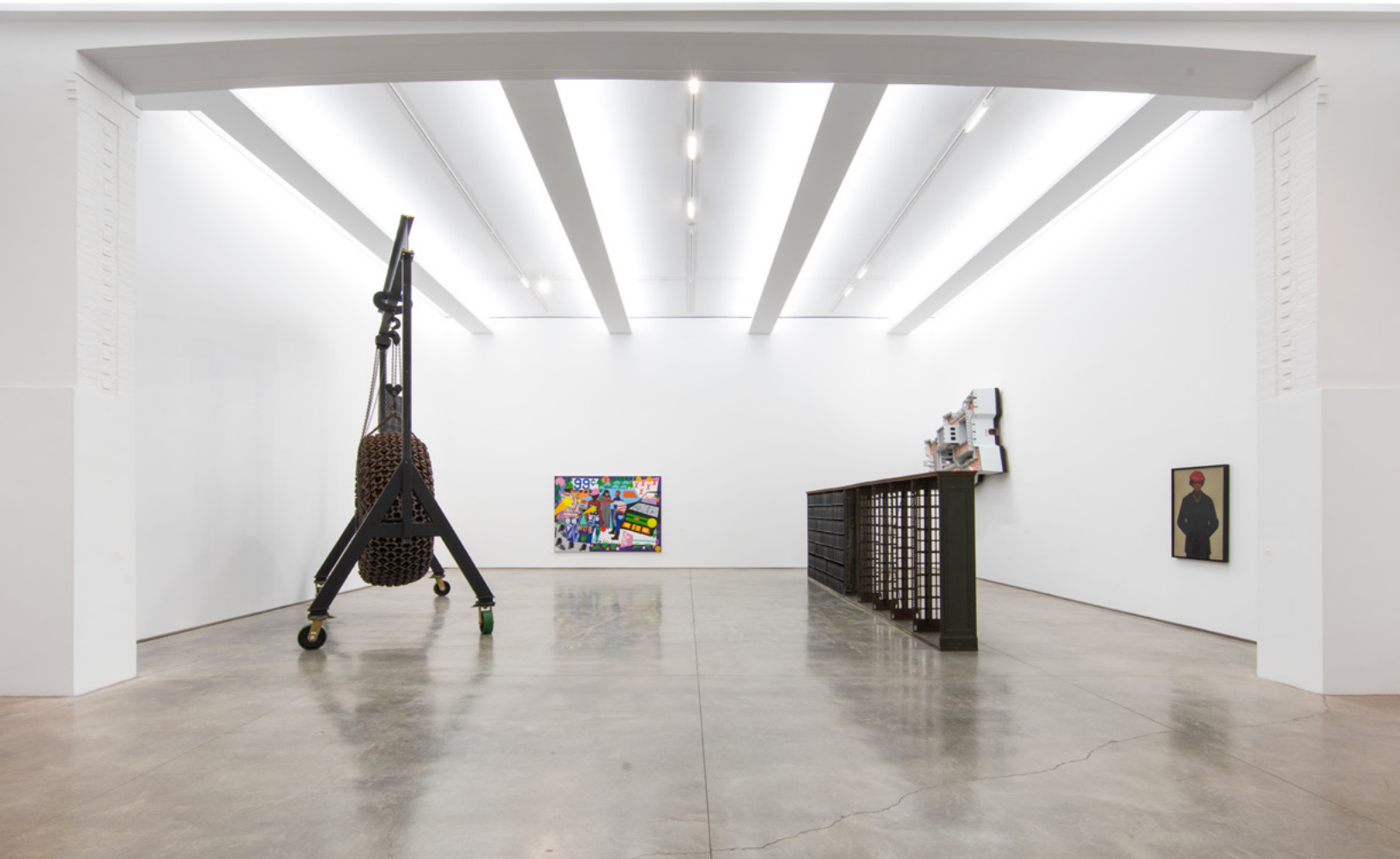
Installation view, This Tender, Fragile Thing , 2022 The School | Jack Shainman Gallery, Kinderhook, NY