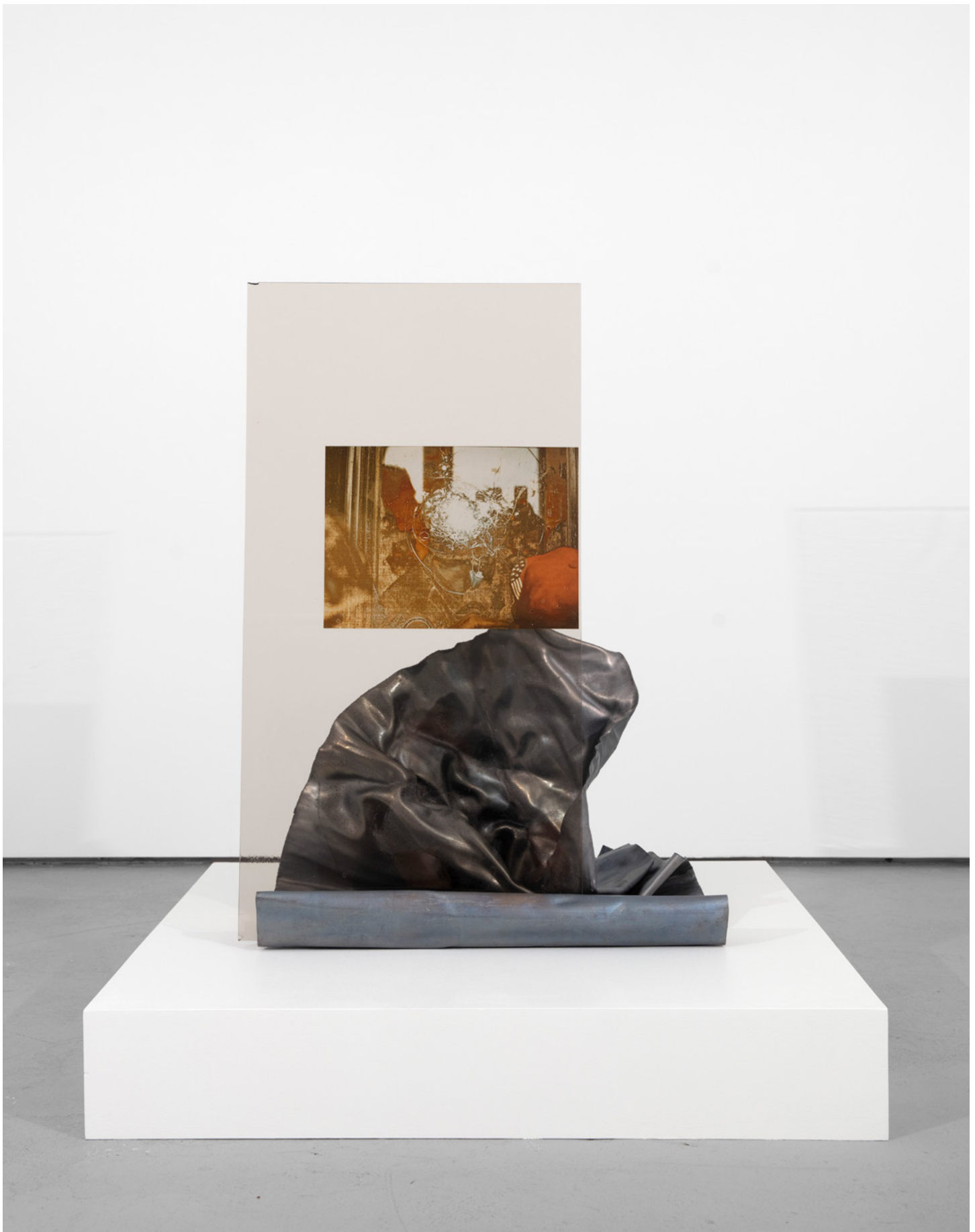
Charisse Pearlina Weston, I live in a stiff body; I am erected (to clench, to jolt) , 2021 Photographic decal on etched glass, lead | 36 x 26 1/2 x 9 inches | #CPW21.001