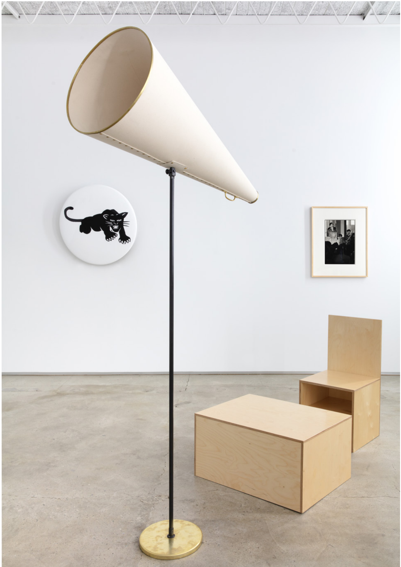
Installation view featuring Hank Willis Thomas, Carrie Mae Weems, and Stephen Shames, This Tender, Fragile Thing , 2022 The School | Jack Shainman Gallery, Kinderhook, NY