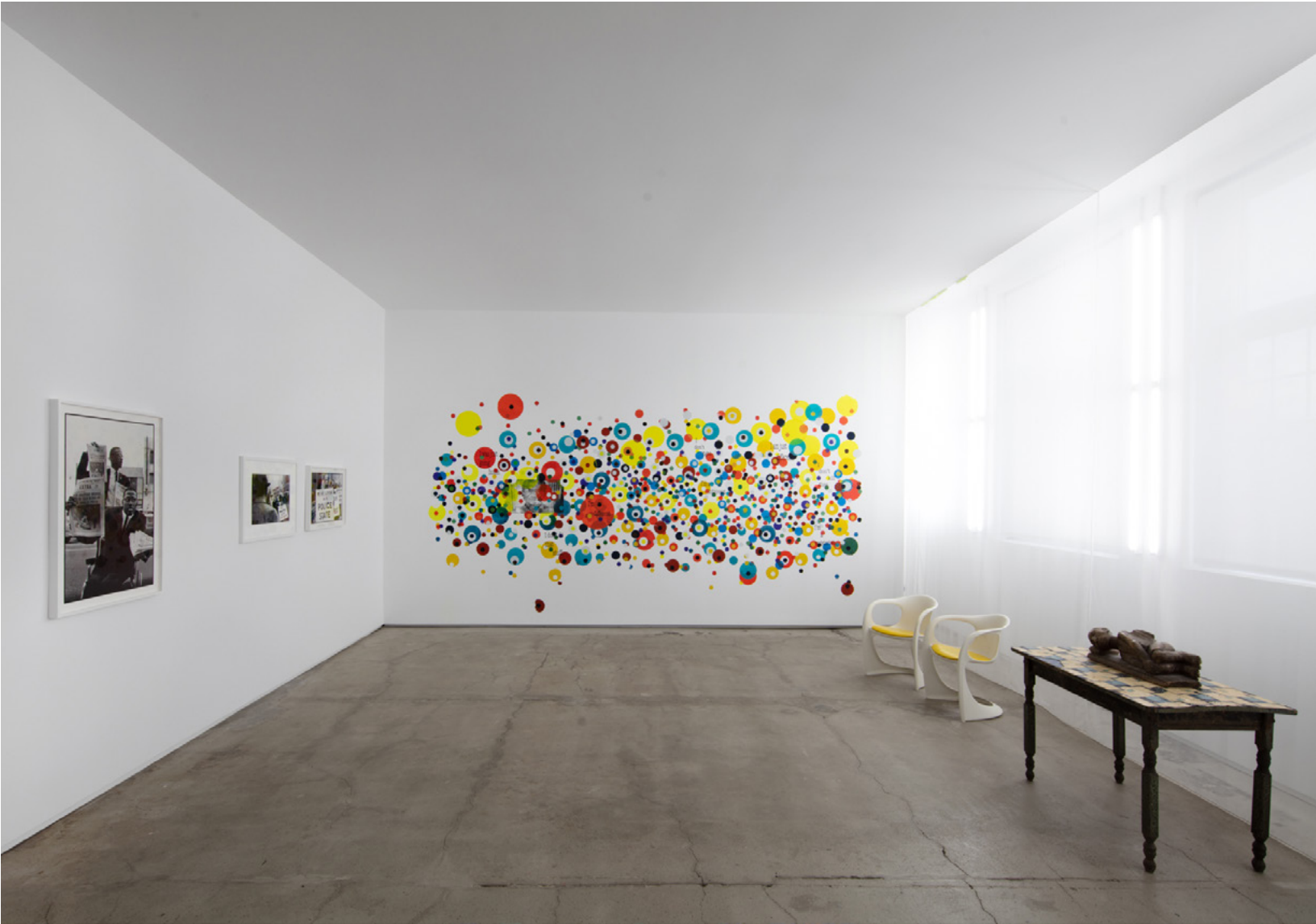
Installation view, This Tender, Fragile Thing , 2022 The School | Jack Shainman Gallery, Kinderhook, NY